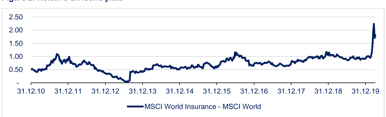
Figure 2: Relative dividend yield

In part due to such moves, the dividend yield of the insurance sector has only increased given 8% relative underperformance of the insurance sector versus broader equity markets year to date. The current dividend yield on the MSCI World Insurance Index of 4.9% is now well in excess of the broader MSCI World Index dividend yield of 3.1%. Such a level of relative yield differential has not been seen for at least 10 years the graph below shows. Twelve notes an even larger gap in many mature markets, such as the UK and Europe, where sources of secure dividend yield have become scarce.